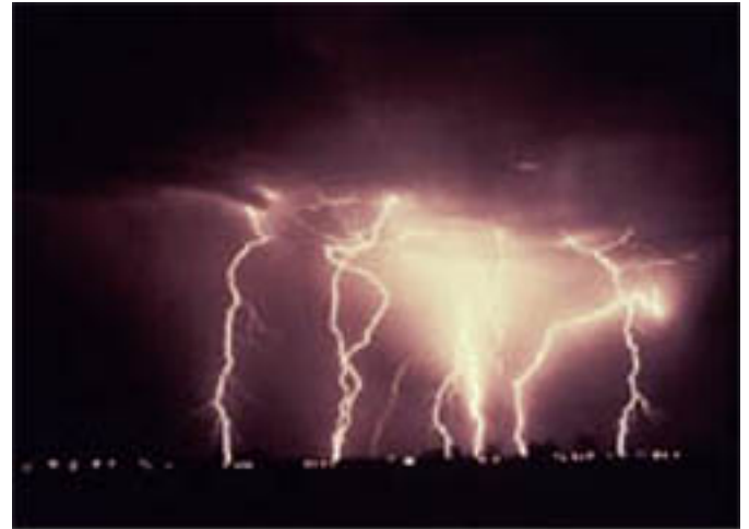
Intense cloud-to-ground lightning caught using time-lapse photography. Norman, OK March, 1978

Lightning originates around 15,000 to 25,000 feet above sea level when raindrops are carried upward until some of them convert to ice. For reasons that are not widely agreed upon, a cloud-to-ground lightning flash originates in this mixed water and ice region. The charge then moves downward in 50-yard sections called step leaders. It keeps moving toward the ground in these steps and produces a channel along which charge is deposited. Eventually, it encounters something on the ground that is a good connection. The circuit is complete at that time, and the charge is lowered from cloud to ground.