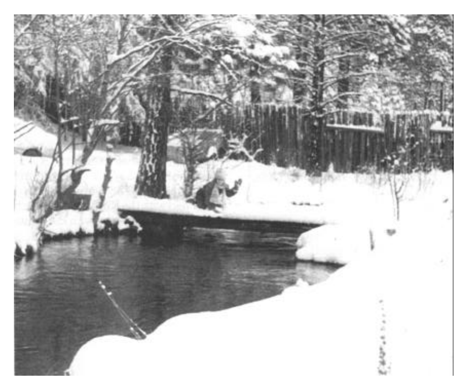
A quiet creek by a wilderness home.

from Plutarch's Lives, Themistocles (c. 528 - c. 462 B.C.)