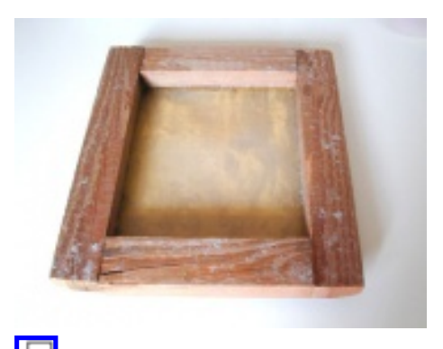
Homemade frame seen from the top

Make a frame for preparing the paper. Stretch a fiberglass screen - for example, a window screen - over a wooden frame (an old picture frames work well for this, or you can build your own) and staple it or nail it to the <u>frame</u>. The screen should be pulled as tightly as possible. Make sure to construct the frame large enough to hold the size of paper you wish to make.