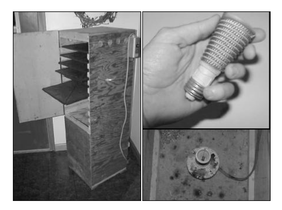
Left: The dryer cabinet and the polycarbonate trays. Right: The 600-watt ceramic heat coil screws into an ordinary porcelain lamp base.

For our dehydrator, I began by purchasing the light polycarbonate trays. I then designed and built the dryer cabinet around them. After considering various materials for constructing the trays from scratch, and after studying the effects of these materials on some foods, I decided the trays were what were needed. The acids in some foods may react unfavorably with certain metals such as aluminum screen. Wood, as used in dowel rod-type trays may absorb food tastes and odors. Fiberglass screen can leave minute fiberglass splinters sticking to the dried food. Galvanized screen is out, due to its zinc-based coating reacting with foods. One material which I have not tried, and which may warrant experimentation, is nylon screening. If stretched tightly on light wooden frames, this material might be durable enough to withstand repeated use. I do not know of any health problems posed by the use of the material on dryer trays. The trays that we used were simply better than any alternative that I could come up with at the time.